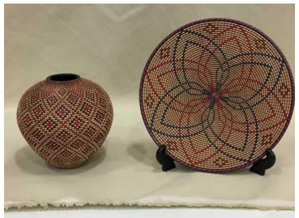
Rich Wooley basket illusion design