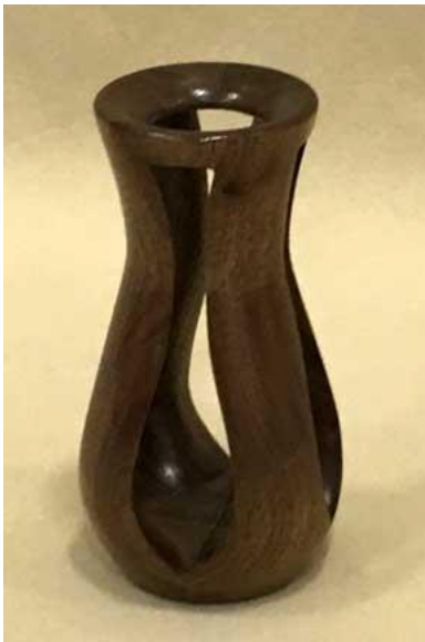
Al Servis inside-out vase