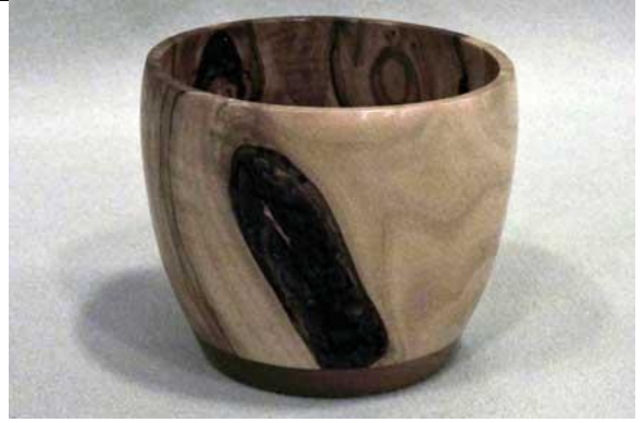
Frank Slim vase / bowl