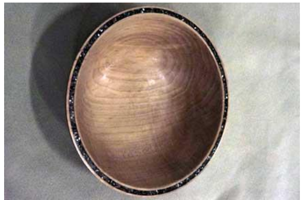
Unknown Bowl 1