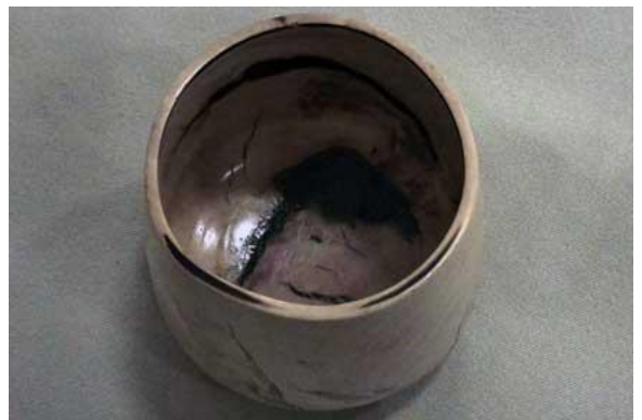
Unknown bowl 2