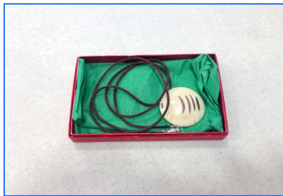
Jim Dupler showed a pendant