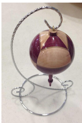
Wilkerson some jects