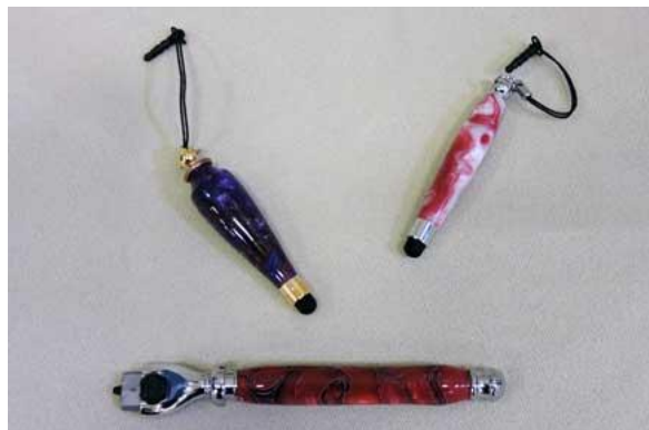
Jennifer Flynn acrylic razor handle and stylus