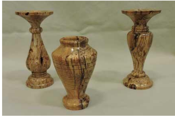
Ed Archer candlesticks and vase