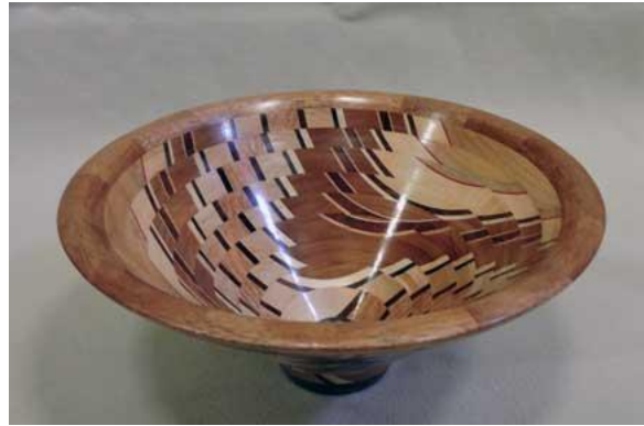
Pat & Dave Wilkerson maple, walnut and mahogany bowl