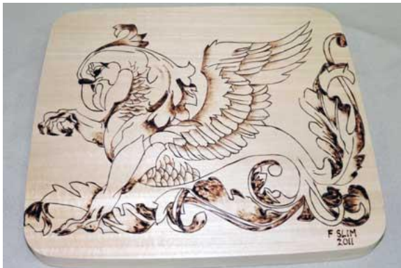
Frank Slim Basswood wood burning