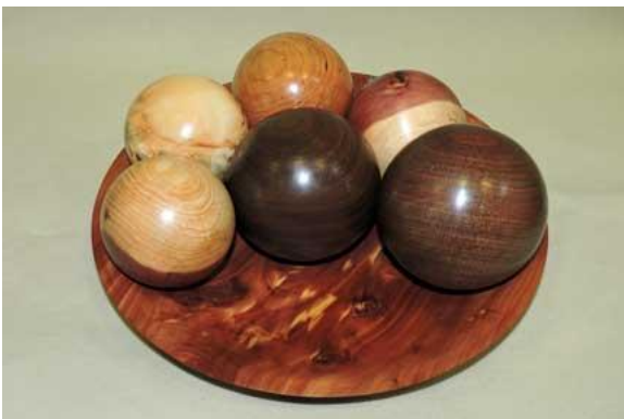
Otto Folkerts spheres