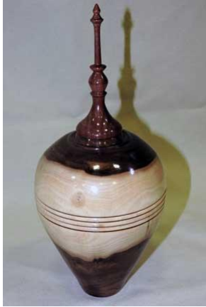
Pat Wilkerson walnut vase