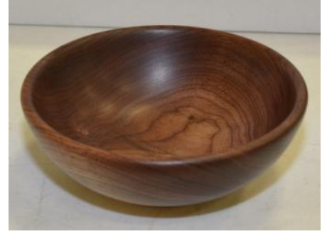
Rich Parker showed us some very nice Black Walnut bowls