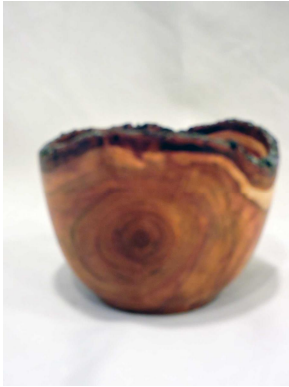
Natural edge bowl Cherry sphere Both Finished with Watco Danish Oil Rich Parker